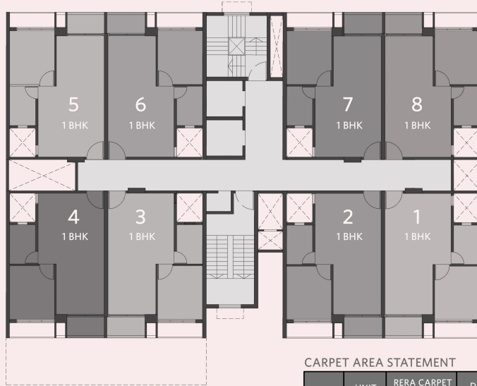
TORINO (S + 12)